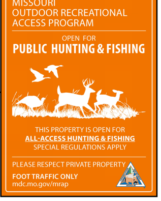
<u>Area Name: Highway V Trac</u>t